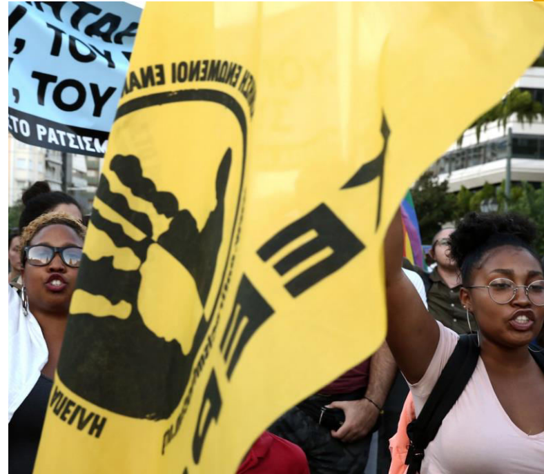
Afro-Greek demonstrators shout slogans during a protest march against racism in Athens, 17/8/2017 [Simela Pantzartzi/EPA]

Source: ‘They don’t accept you’: Afro-Greeks struggle to be seen’ Aljazeera.com