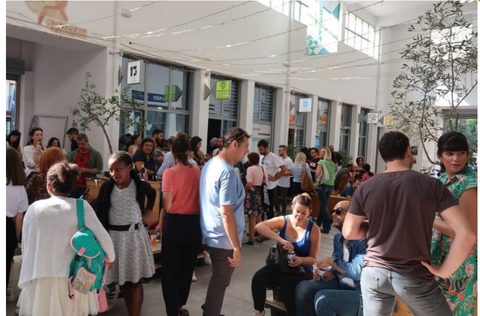
Event at the Kypseli Municipal Market