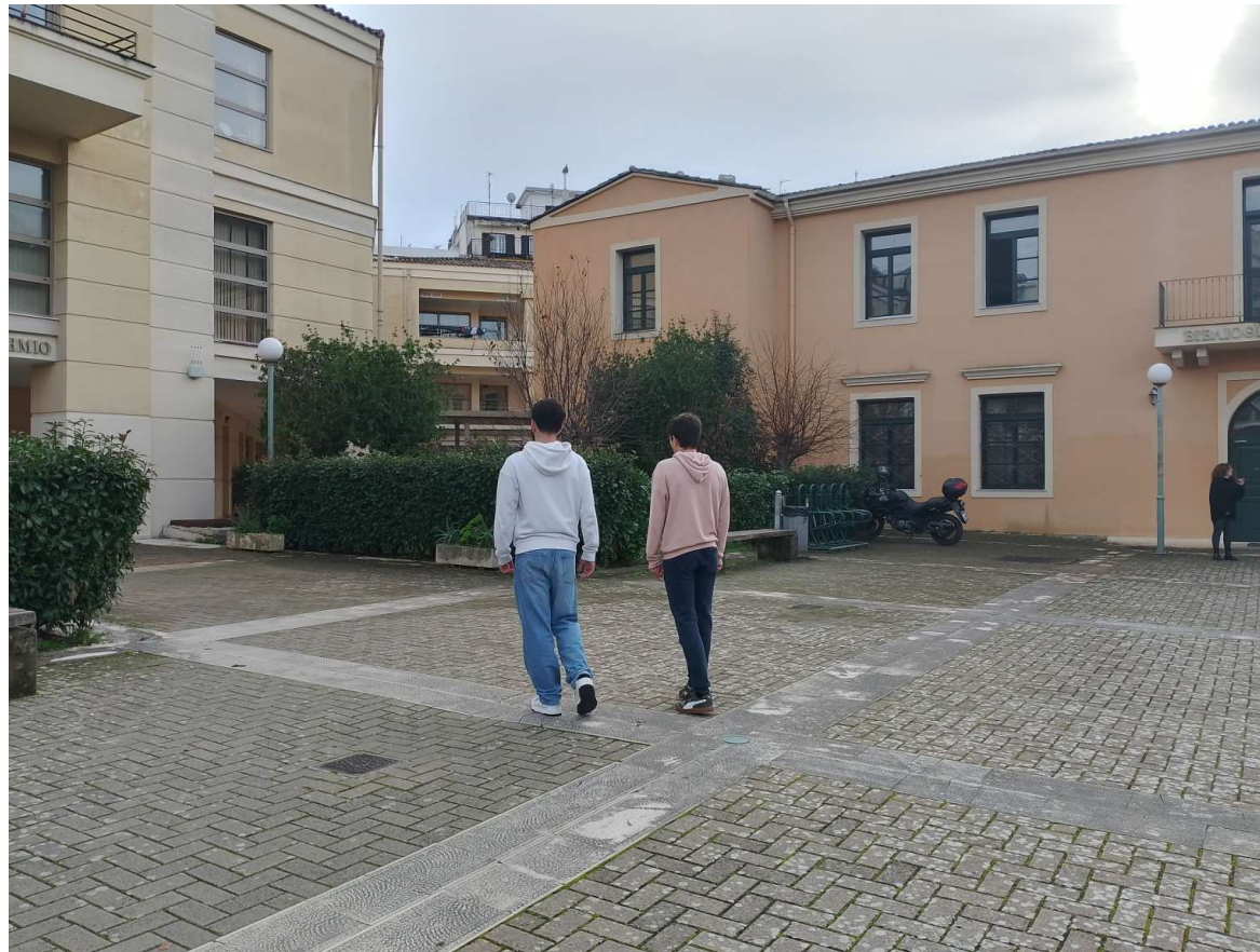
This is the courtyard of the university.