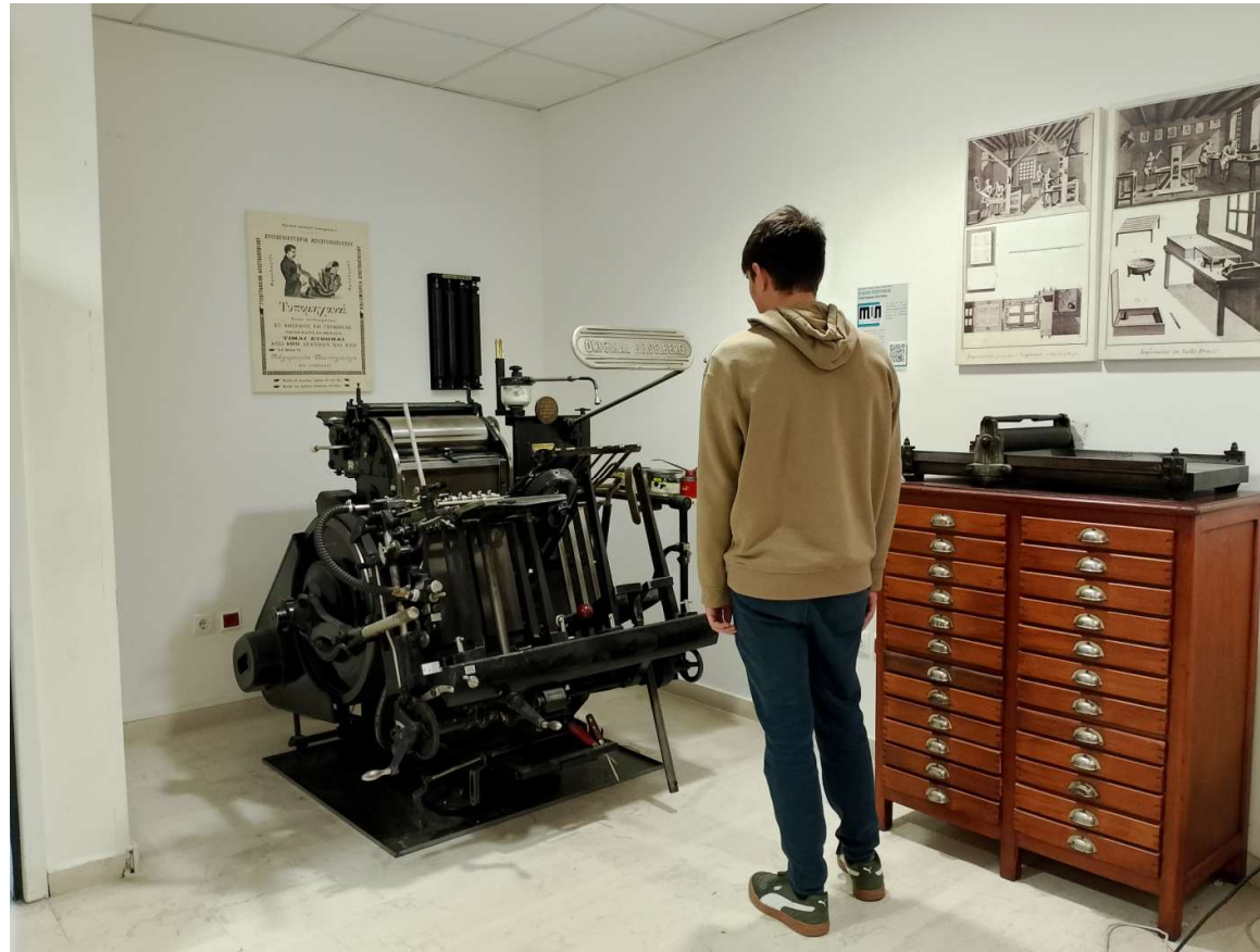
I also see the printing press.