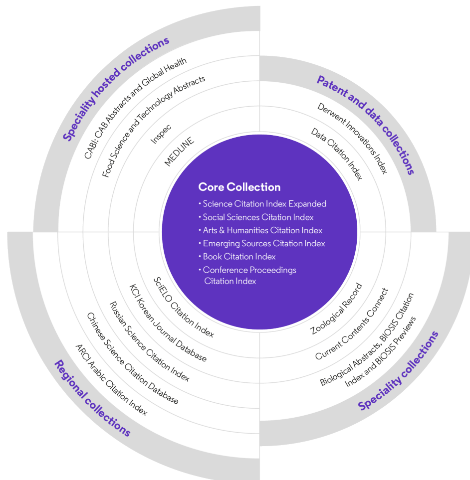
Figure 1: The Web of Science product collection

...to the backbone of our editorially curated Web of Science Core Collection, the world's only true citation index. Access the interconnected history of science to drive future innovation.