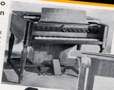
Simple controls above the keyboard produce a wide variety of tones

MUSICAL tones almost identical with those produced by a piano, harp, sord, oboe, violin, trumpet, French horn, and other instruments are created by an amazing electric piano recently invented by Laurens Hammond, of New York City. Fitted with a single keyboard of seventy-two keys, which are operated exactly like those of a piano, the electric orchestra contains no pipes, reeds, strings, hammers, or other vibrating parts, but produces its tones solely through a circuit of tuned vacuum tubes. These tones are varied over a wide range by means of simple controls mounted on a panel above the keyboard. Volume of sound is controlled accurately by a foot pedal.