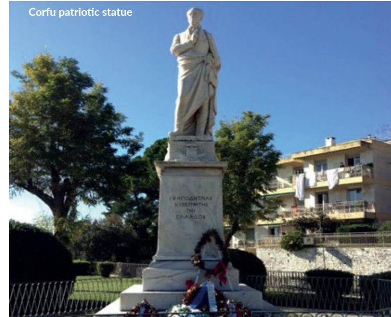
Corfu patriotic statue

Corfu Town is the capital of the Greek Ionian Islands. It stands at the crossroads of multiple historical influences reflected in a unique Corfiot culture. For well over a thousand years Corfiots have experienced conquest, colonialism, conflict and discord largely rooted in ethnicity, imperialism, populism, regionalism, nationalism and sectarianism. HEIRNET 2018 will examine the discourse on these and related themes and their impact on History Education's theory, scholarship, research, policy and practice.